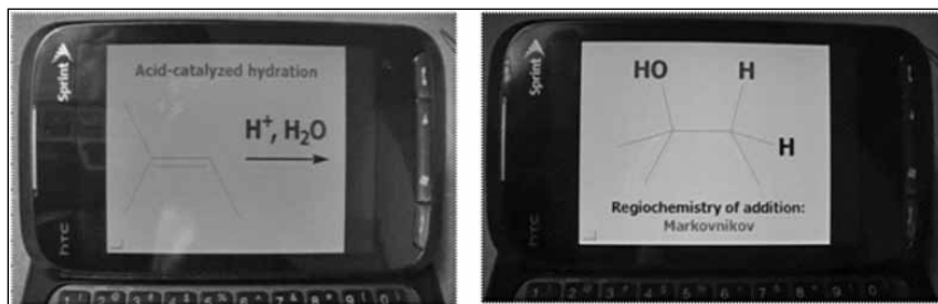
Figure 2. Organic reaction digital flash cards.

Students have access to digital flash cards for such topics as functional groups and reactions (Figure 2), to name but a few. As GGC is an open access institution and many of our students cannot afford their own handheld device, iPod Touch devices have been purchased for two sections of students through the GGC Vice President for Academics and Student Affairs (VPASA) seed grant program. There are also numerous computer labs throughout campus, as well as free campus-wide WiFi, that students may use to access material.