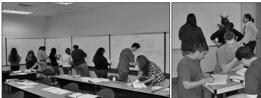
Figure 1. Thayer Method class activities.

This interactive and engaging class format allows for student recitation under the watchful eye of the instructor, offering students opportunities to develop their oral and written communication skills in a low stress environment. Figure 1 illustrates typical class activities using the Thayer Method. The lab program is also directly integrated and synchronized with the class, using the same instructor for each lab and class section. This approach has the synergistic benefit of enabling instructors to incorporate chemical demonstrations which link classroom topic discussions to the laboratory experiment.